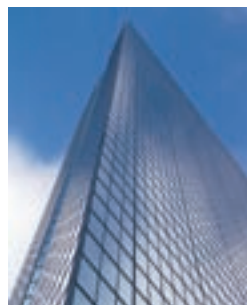
HVAC / Building management