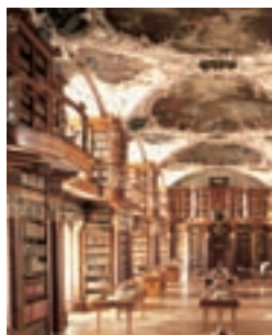
Museums, art galleries

The HygroPalm2-series (with integrated or interchangeable probes) is ideal for all applications where exact measurement of humidity and temperature is of decisive importance, e.g. the food and pharmaceutical industries, printing and paper industries, many trades, the sciences, meteorology, agricultural sector, climatology, etc. There is hardly a field today in which these parameters may be ignored. It is ultimately the measuring task at hand that defines the HygroPalm instrument that best meets your needs.